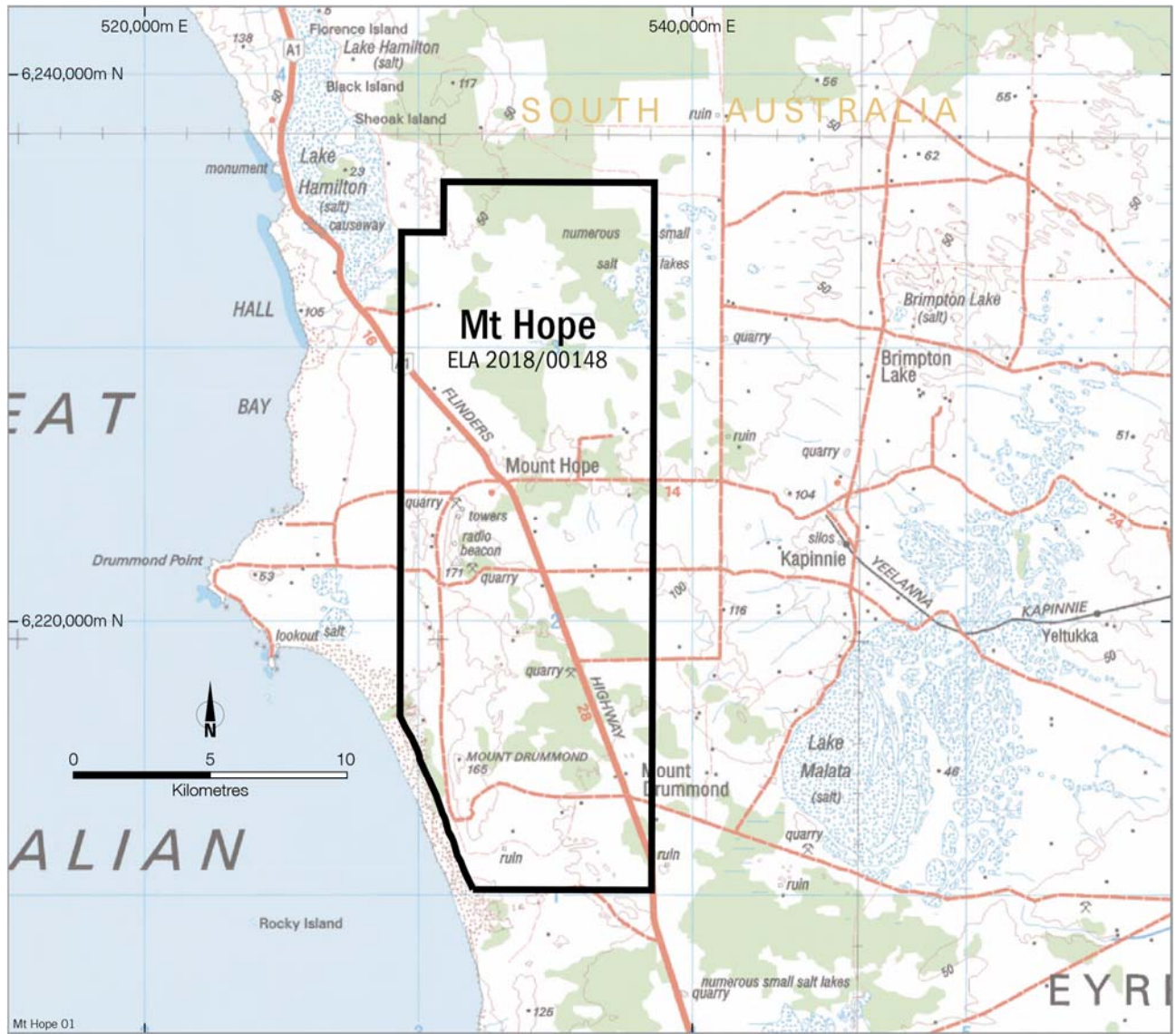
Figure 2 – Mt Hope Exploration Licence Application Area