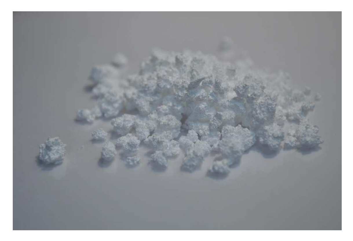
High Purity Alumina crystals (99.9855% Al<sub>2</sub>O<sub>3</sub>)

HPA is a new age material critical in the manufacture of many high-tech products of today including the rapidly expanding battery technologies and energy storage sector, LED lighting, and sapphire glass used in the production of smart phones and TV screens.