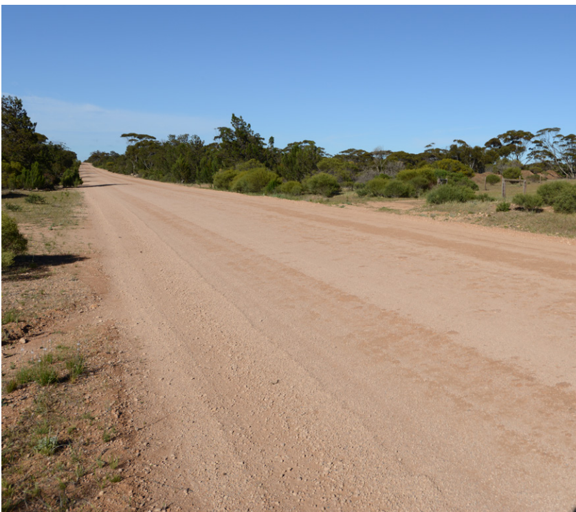
Poochera - Port Kenny Road, just north of the proposed access road.

The existing lane and shoulder widths of Streaky Bay Road to Poochera are also acceptable, based on the PBS.