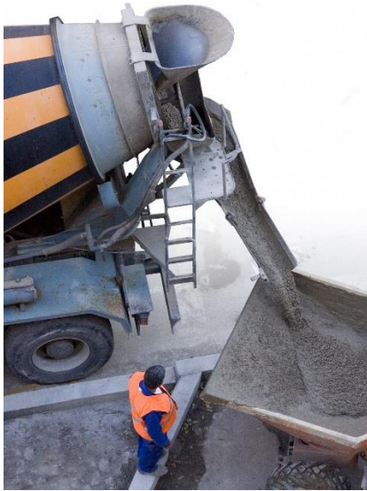
Figure 1 – Great White HRM™ concrete application testing