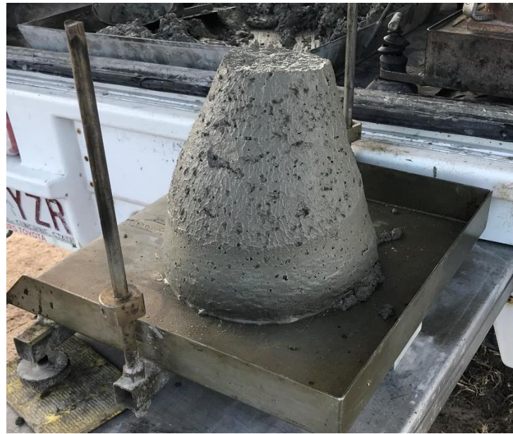
Figure 2 – Great White HRM™ concrete sample, showing enhanced form retention